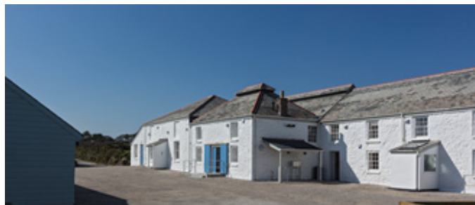
Graham Gaunt Photowork